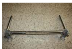
Lower Transom Bar