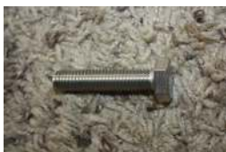
Stainless Transom Bolt