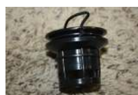
Spare Inflation Valve