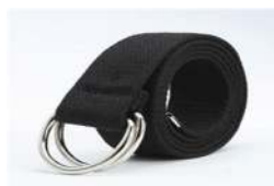
Bow Support Straps