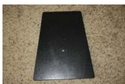
Outer Motor Board