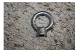
Stainless Transom Eye Nut