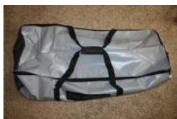
Transom Storage Bag