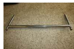
Upper Transom Bar