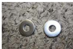
Stainless Transom Washer x2