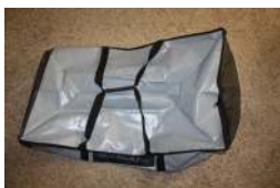
Tube Storage Bag