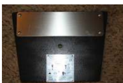
Inner Motor Board